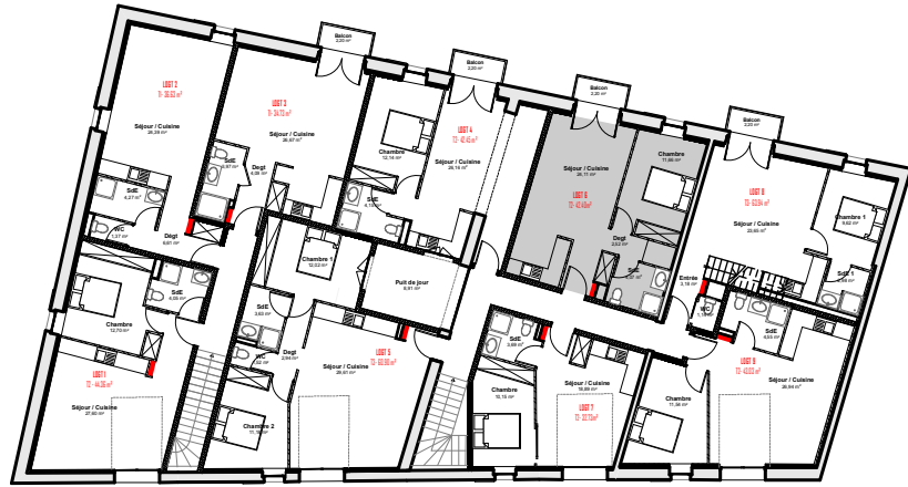
PLAN NIVEAU 1